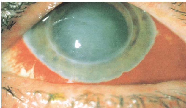
Figure 1. (Reinhard) Interstitial keratitis on the graft of a patient after astigmatic LASIK.